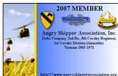
2007 Membership: laminated paper.

We will mail your membership card, shirts and/or cap to you if you will not attend the reunion in D.C. Check the space under TOTAL PAYMENT (registration form) indicating you will not attend the reunion and would like the items sent to you. The Life Member card is like a plastic credit card and the 2007 Membership card is laminated paper, as in Orlando.